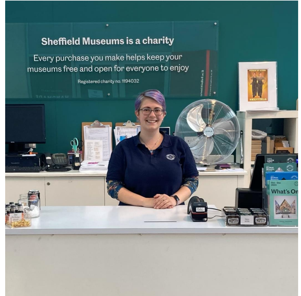
This is the shop.